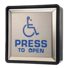
Push Plate Switch