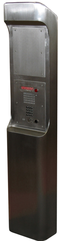
ETP-PMD-SS shown with ETP-400K and 25141 blank stainless faceplate