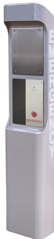
ETP-PMD shown with VOIP-600E and 25141 blank stainless steel faceplate