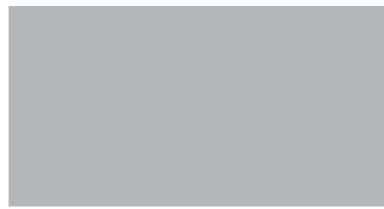
ALUMINUM 57GR RGB: 179,182,184